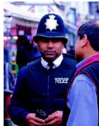
Sir Ronnie Flanagan GBE QPM

The report should very much be interpreted as interim. While I have been pleased at the extensive response to our published request for contributions to the Review, there remains much to be done. I am particularly anxious to engage in much wider public consultation as the work progresses. I am deeply indebted to the many people and organisations giving me so much time and effort in this work and they will of course be properly acknowledged in the final report which I hope to submit early next year.